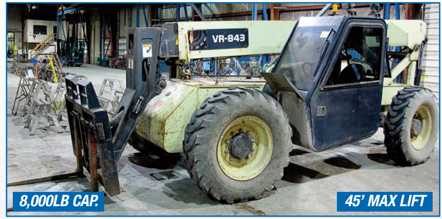
INGERSOLL-RAND VER-843 TELESCOPIC FORKLIFT