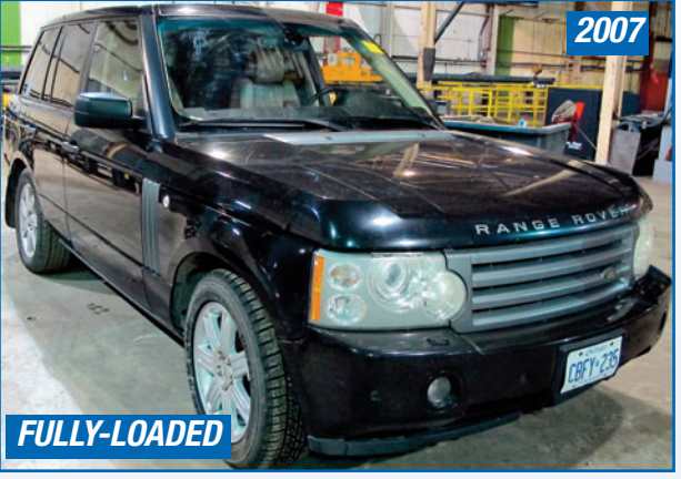
RANGE ROVER LAND ROVER HSE SUV