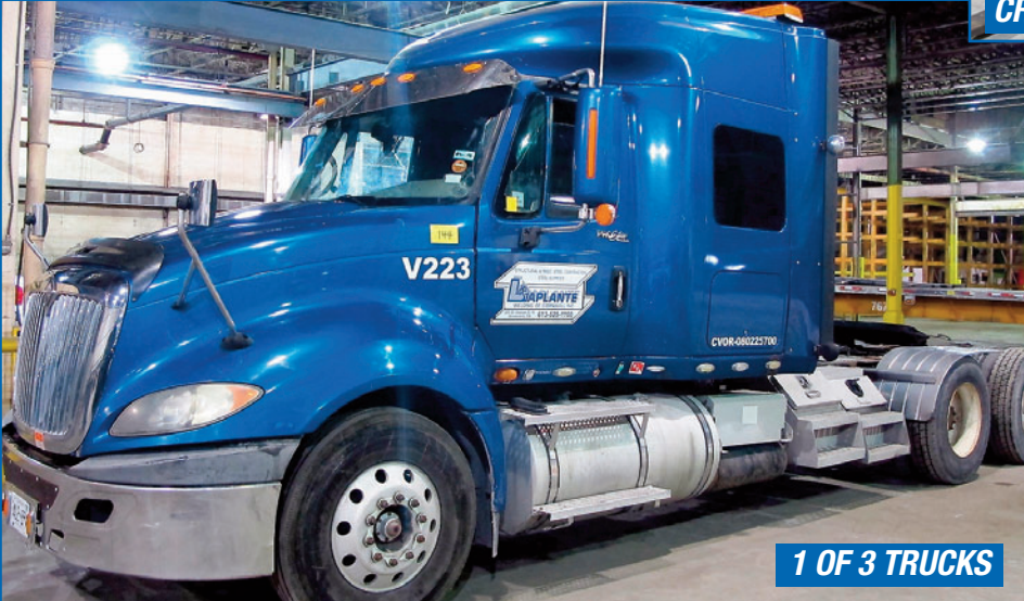
INTERNATIONAL PROSTAR PREMIUM 6X4 TRUCK