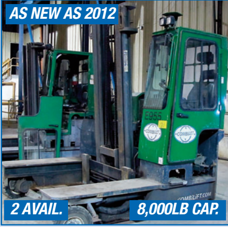
COMBILIFT MULIT-DIRECTIONAL FORKLIFTS