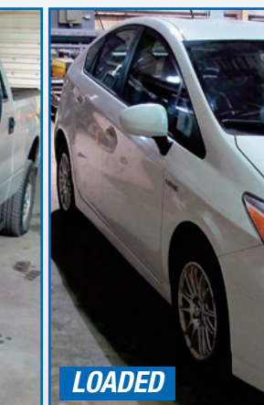
TOYOTA PRIUS HYBRID