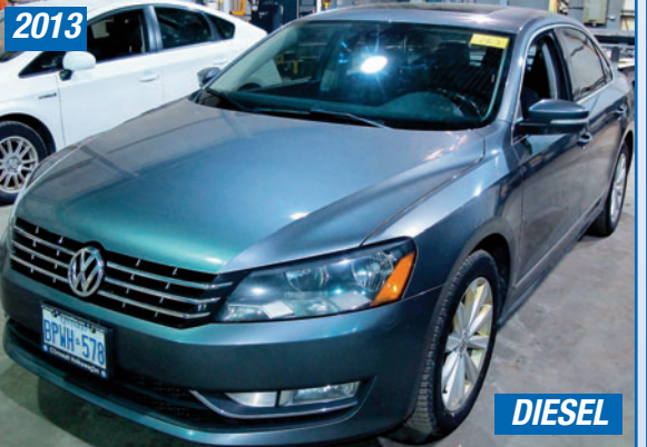
VOLKSWAGON PASSAT 2.0 TDI