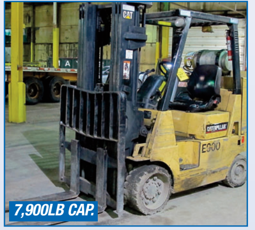
CATERPILLAR GC40K-STR PROPANE FORKLIFT