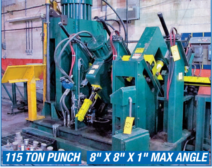
CONTROLLED AUTOMATION ANGLE MASTER ABL-100 ANGLE LINE