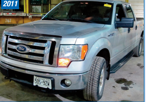
FORD F150XLT SUPER CREW PICKUP TRUCK