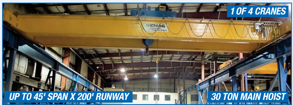
DEMAG BRIDGE CRANE SYSTEM