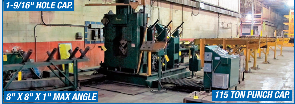
CONTROLLED AUTOMATION ANGLE MASTER ANGLE LINE