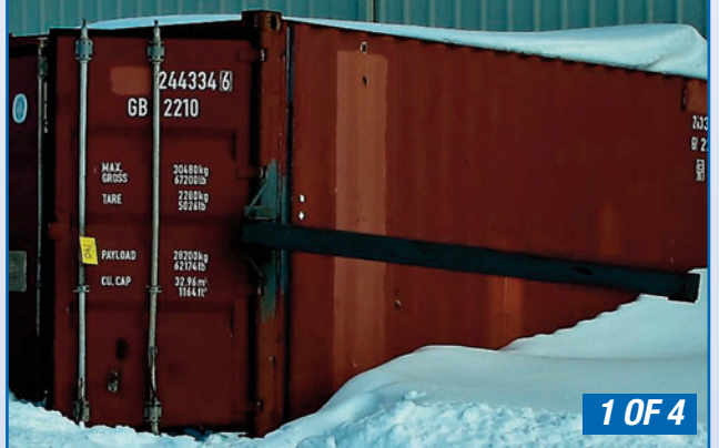
PARTIAL VIEW OF SEACANS

Hydraulic Cambering & Beam Straightening Machine, 30 Ton Cap., (2) Hydraulic Power Packs, Approx. 9'W x 23-1/2'L, GE 300 Line Control, Power Pack Pendant Control, (4) Hydraulic Cylinder Straighteners, 22-1/2" Between Straighteners