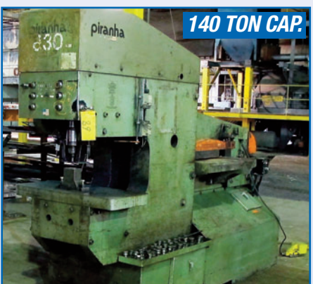
PIRANHA PII140 IRONWORKER