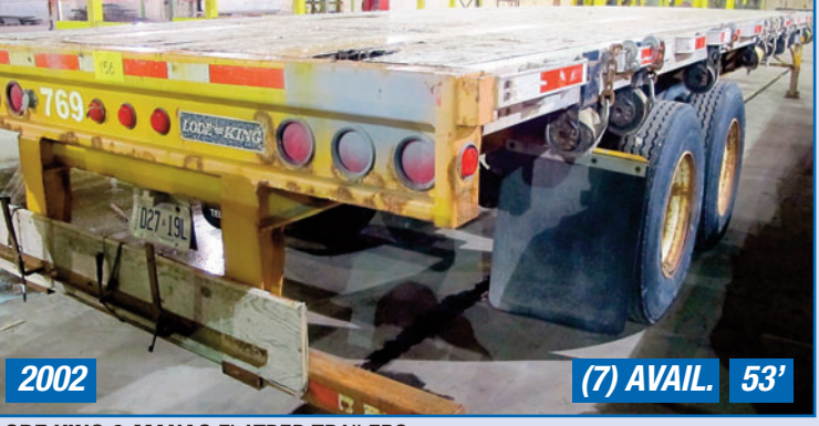
Bid ONLINE at BidSpoter.com