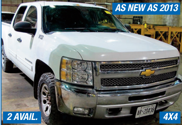
CHEVROLET SILVERADO 1500 LT PICKUP TRUCK